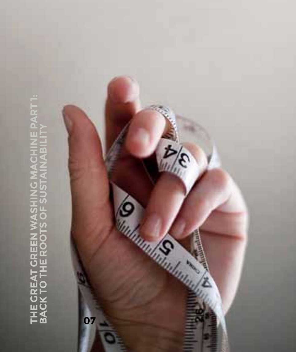
THE GREAT GREEN WASHING MACHINE PART 1: BACK TO THE ROOTS OF SUSTAINABILITY

T he concept of sustainability is ubiquitous in the fashion industry, 8,9,10 yet the use of the term ‘sustainability’ is neither protected nor controlled, nor does it have any legal significance. 11 Globally, however, there is consensus on what sustainability is, and what impacts need to be measured. The aim and objective of this report is to remind all stakeholders in sustainable fashion of exactly what that globally agreed definition stipulates. As well as to demonstrate how this is inconsistent with current interpretations of sustainability in fashion, and to highlight what this means for corporations, initiatives, and government agencies that are attempting to measure sustainability, guide brands on sustainable sourcing, and/or advise consumers on ‘sustainable’ purchases.