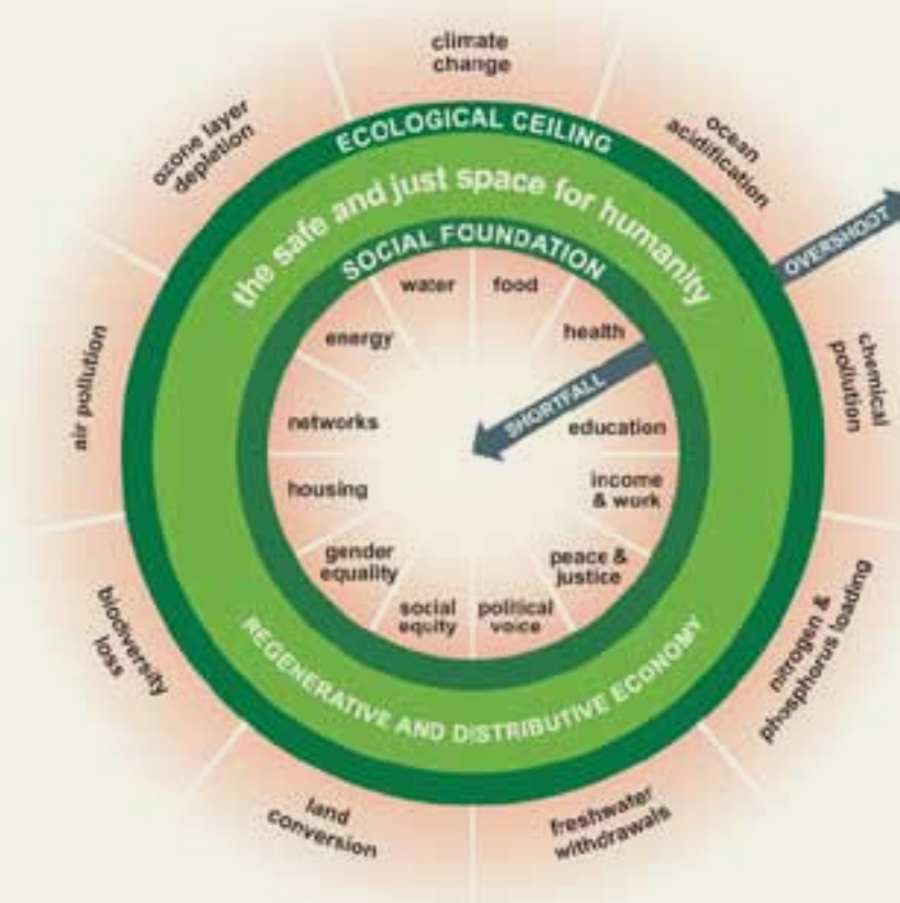
Figure 1. The Concept of Doughnut Economics

[ https://doughnuteconomics.org/license ]